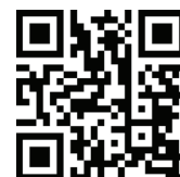
MACK CITY PARKING