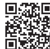
MAP MY RIDE