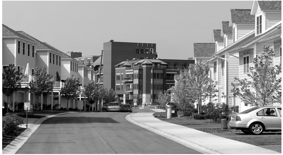
The Midtown development in Traverse City integrated some permanent affordable housing units into an otherwise market-rate development

To encourage builders to participate in inclusionary programs, most ordinances offer incentives that can offset costs and provide valuable flexibility for a project. Density bonuses, which allow a developer to build more units than normally allowed, are a common incentive; but incentives may also include flexibility for parking, height, and setback standards. Regardless of the incentive used, it's important that it's attractive to developers, in order to encourage the use of voluntary inclusionary regulations. By offering carefully designed incentives, local governments can ensure that the inclusion of affordable housing makes economic sense to the builder.