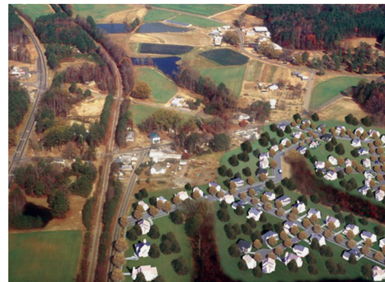
Architectural renderings depict the town of Cary, North Carolina filling in with development while preserving open space.