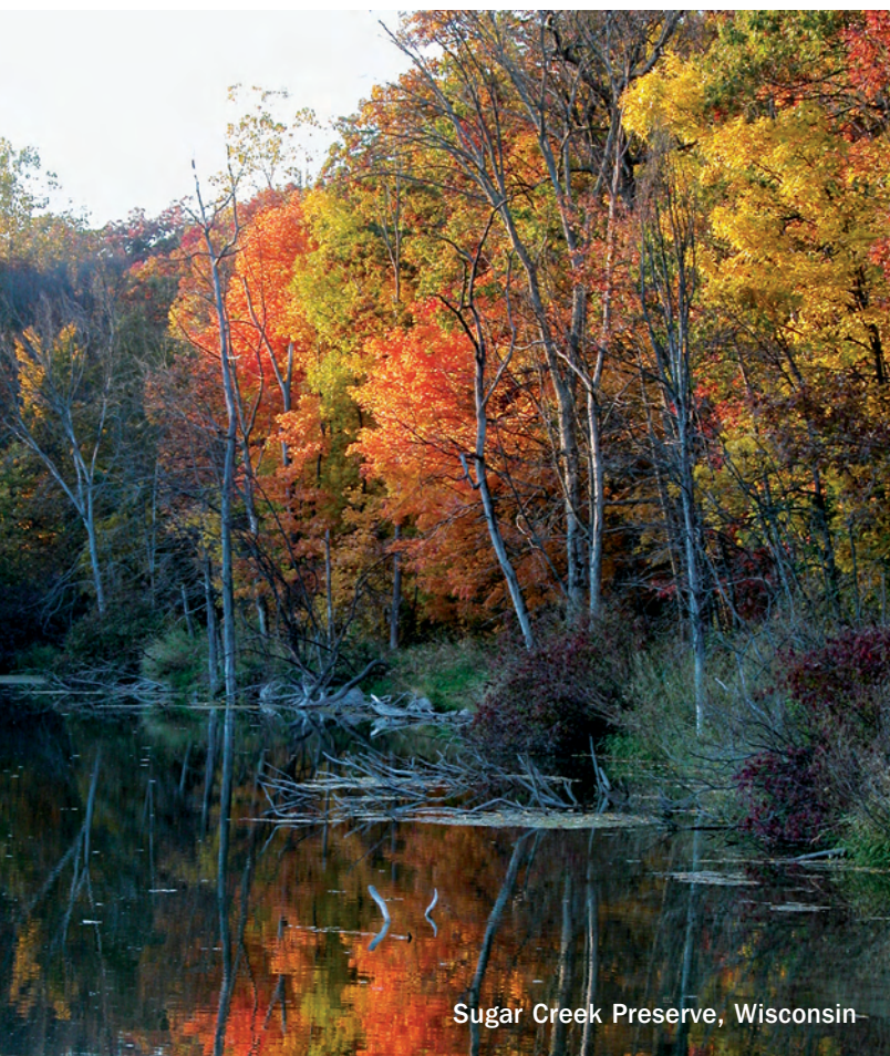
Sugar Creek Preserve, Wisconsin