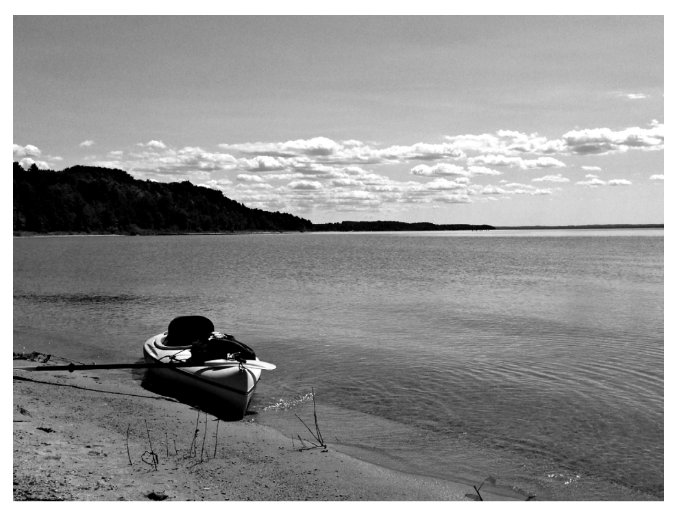
Recreation in Northwest Michigan is an important part of the quality of life and economy of the region.

Developing and maintaining recreational facilities requires significant financial and operational commitments. Some communities struggle to maintain or update existing facilities, while others are unable to provide new recreation opportunities needed by their residents. While a number of state and other grant opportunities are available to communities, some communities lack the expertise or staff capacity to pursue or administer grant funding.