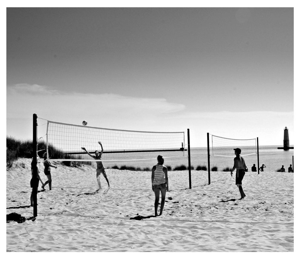
Northwest Michigan's many beaches are enjoyed by local residents, seasonal residents, and visitors.

Volunteer groups can help make the most of limited budgets, particularly for regular maintenance needs; and Northwest Michigan is served by countless dedicated individuals that donate their time and resources to improving the region's natural environment and recreation opportunities. The Sleeping Bear Dunes National Lakeshore alone sees 29.595 volunteer hours from 850 individuals that together invest over $650,000 worth of time and talent in the park.11 In addition, scouting and other service groups often partner with many communities to address specific maintenance or park improvement needs. Other communities work with their sheriff's departments to obtain assistance from jail crews to perform some maintenance and improvement activities. The Northwest Michigan Invasive Species Network, a group made up of natural resources organizations and driven largely by volunteer labor, works with communities throughout