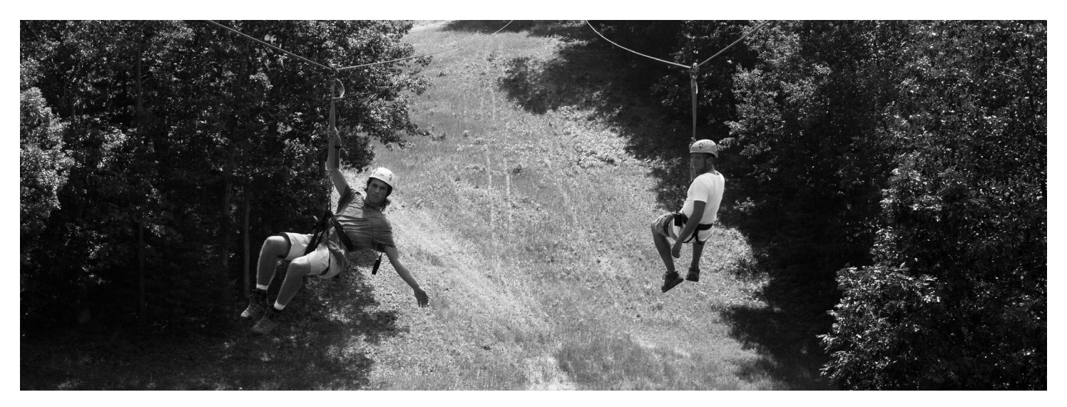
Mt. Holiday, a community nonprofit recreation area, formed to preserve an existing ski hill and offer additional recreational facilities to the region.

Volunteer participation is also critical in addressing invasive species and other biological threats to the natural environments that make up many of the region's recreation facilities. Forestry management plans can also aid in ensuring that these threats are addressed in a cohesive manner, while allowing for the profitable and sustainable harvest of timber in some areas.