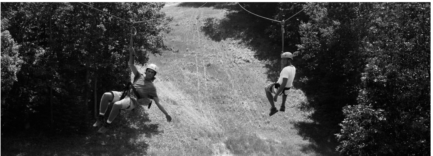
Mt. Holiday, a community nonprofit recreation area, formed to preserve an existing ski hill and offer additional recreational facilities to the region.

Volunteer participation is also critical in addressing invasive species and other biological threats to the natural environments that make up many of the region’s recreation facilities. Forestry management plans can also aid in ensuring that these threats are addressed in a cohesive manner, while allowing for the profitable and sustainable harvest of timber in some areas.