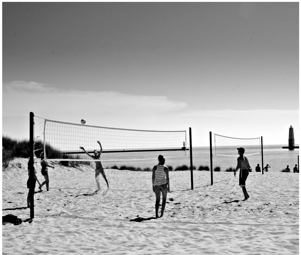
Northwest Michigan's many beaches are enjoyed by local residents, seasonal residents, and visitors.

Volunteer groups can help make the most of limited budgets, particularly for regular maintenance needs; and Northwest Michigan is served by countless dedicated individuals that donate their time and resources to improving the region's natural environment and recreation opportunities. The Sleeping Bear Dunes National Lakeshore alone sees 29,595 volunteer hours from 850 individuals that together invest over $650,000 worth of time and talent in the park. 11 In addition, scouting and other service groups often partner with many communities to address specific maintenance or park improvement needs. Other communities work with their sheriff's departments to obtain assistance from jail crews to perform some maintenance and improvement activities. The Northwest Michigan Invasive Species Network, a group made up of natural resources organizations and driven largely by volunteer labor, works with communities throughout