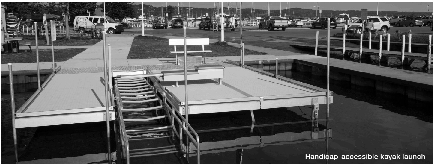
Handicap-accessible kayak launch

Additionally, because recreation opportunities encourage physical activity, which is a fundamental element of healthy lifestyles, communities should ensure that recreation opportunities are accessible and convenient to residents. The presence of parks in and near existing neighborhoods is important in providing convenient recreation access that can encourage physical activity; and linking parks to other uses, neighborhoods, or other parks, through trails or wayfinding, can also improve their accessibility and encourage use of parks.